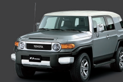
CEMENT GRAY METALLIC/WHITE*